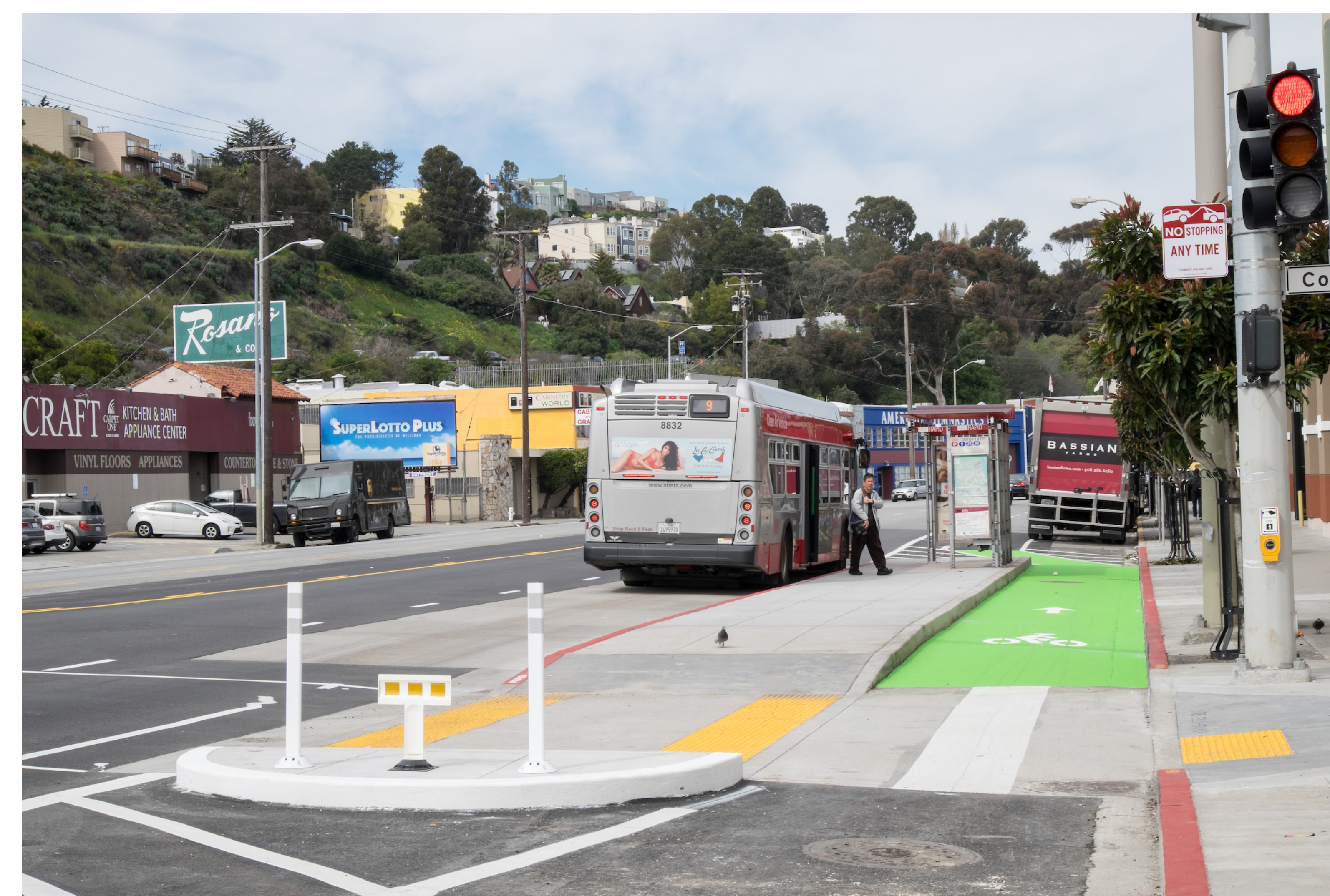
TRANSIT BOARDING ISLAND ON BAYSHORE BOULEVARD

Proposed curbside stops would be similar in design to transit boarding islands on 7th Street, 8th Street, 11th Street and Bayshore Boulevard, with a continuous bike lane between the island and the sidewalk.