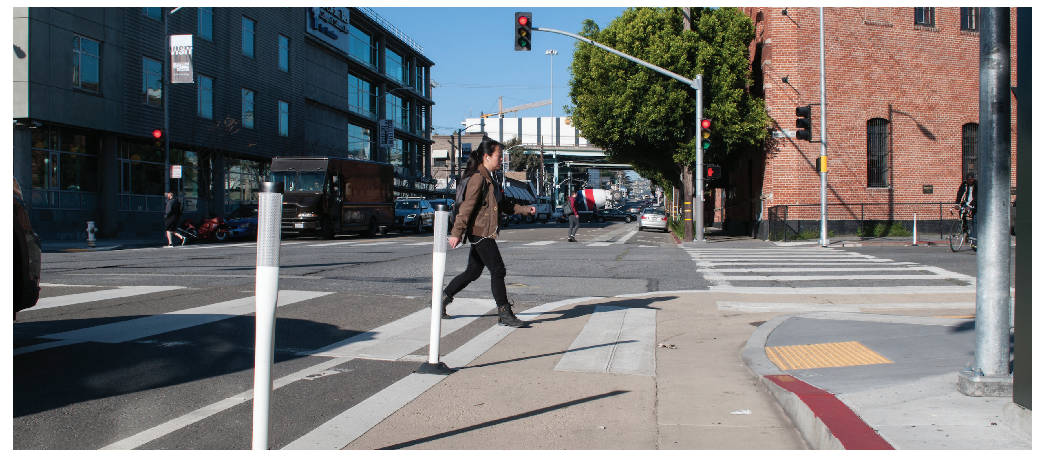
Painted safety zones are khaki-colored painted areas, flanked by flexible white posts, which wrap around sidewalk corners and improve pedestrian safety.